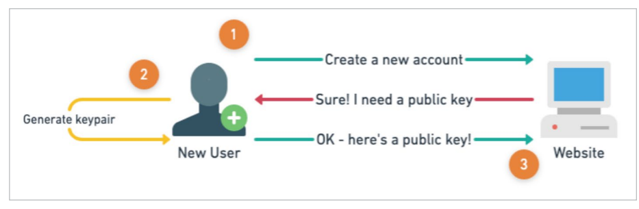
Figure 2. Walkthrough of Initial Account Registration

Now let's examine the same type of transaction using the new WebAuthn specification. As we described, WebAuthn allows for authentication via a cryptographic key exchange, much as you would expect to see when connecting via HTTPS to an