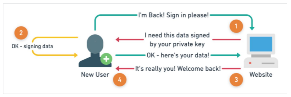
Figure 3. User Authentication Steps with Private Key

After successfully creating an account at some point in the past, the user wishes to return to the site. Upon doing so, the website recognizes the user account and asks the user to sign a randomized string of data.